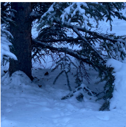
Oh, look! A cylinder and a few triangles!